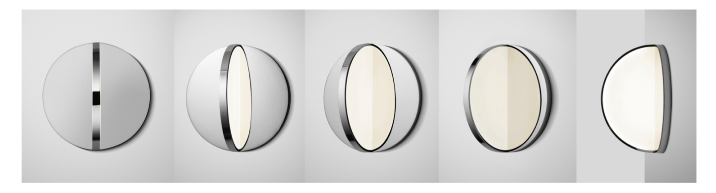
Eclipse Surface Light shown as a wall light from different angles

Available as a single pendant light, chandelier, table lamp, and surface light, Eclipse has a sculptural silhouette with a mobile-like quality that changes at every angle. Using the refractive properties of an etched 10mm solid acrylic core and in-house designed concealed LED technology to create a diffused halo, the design highlights Lee Broom's technical craftsmanship and innovation with his signature mix of classicism and modernity.